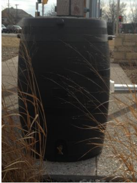
Rain Barrel at Outpost Natural Foods, Mequon