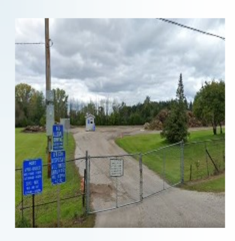
Curbside pickup is not provided by the City of Mequon