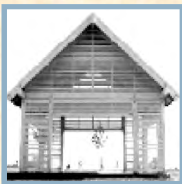
Concept of historic park pavilion