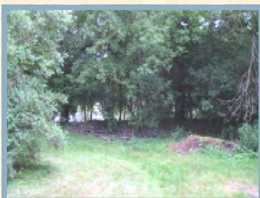
View of the slope at the southern park site