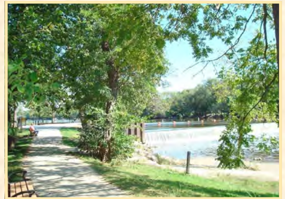
Riverwalk overlooking dam