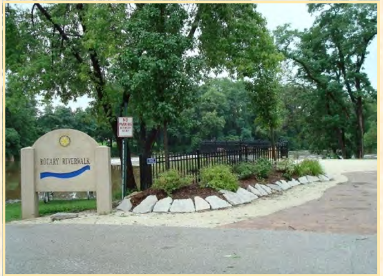
Rotary Riverwalk sign with new fencing

For more information on the project, visit www.mtrotaryriverwalk.org .