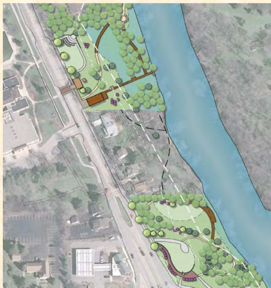
The above concept is one of three proposed master plans which includes a possible phased approach

Park Elements: w The design of a gateway feature at the intersection of Mequon and Cedarburg Road may include a plaza, and Veterans Memorial w Riverwalk paths and overlooks, including connections to the Rotary Riverwalk w Integration with non city-owned parcels w Connections to the Civic Campus w Performance space and terraced seating w Coordination with street-scape projects w Ecological enhancements