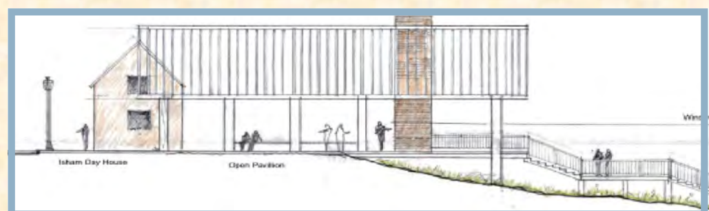
Section through the existing Isham Day House and possible park pavilion