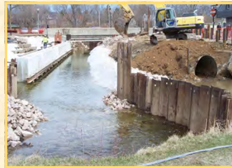
Construction for Pigeon Creek project on Main Street currently in progress.

The Village of Thiensville's Pigeon Creek project widens the creek to its original banks, allows for upstream water retention, removes obstructions, and opens fish passage to the 20 miles of Pigeon Creek tributaries. The improvements from Main Street going east and west are estimated to remove 20% of the properties from the floodplain, therefore creating development opportunities that previously did not exist.