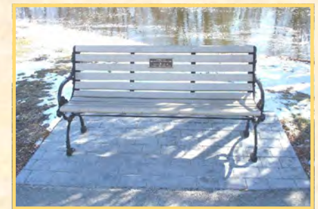
New seating can be found throughout the Village's Town Center area.