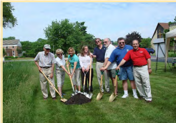
Ribbon Cutting—Library Loop