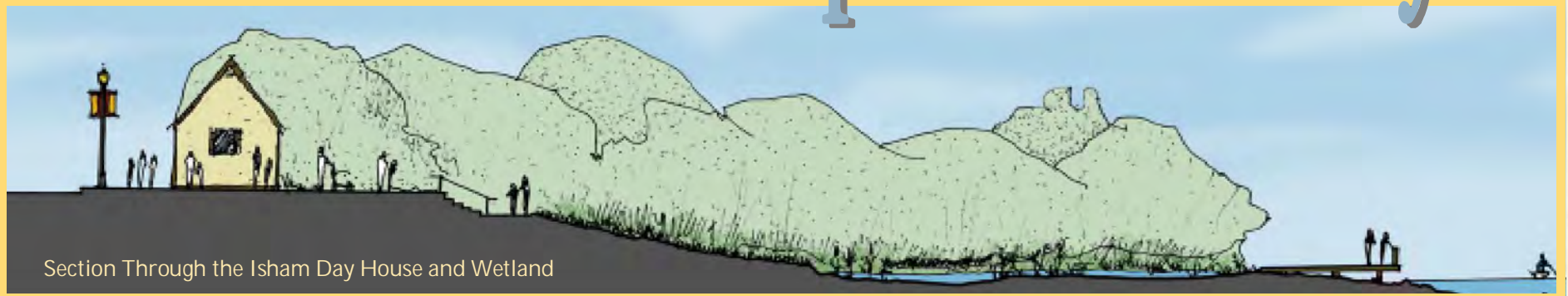
Section Through the Isham Day House and Wetland

The City of Mequon's waterfront properties are viewed as a center point and valuable asset in which to build the Town Center and have the potential to create significant economic and public benefits by attracting new businesses, residential uses, increasing the local tax base and recreational opportunities. City of Mequon hired JJR, LLC & Strand Associates to provide design and development plans for improvements to Settler's Park and the other city-owned properties on the Milwaukee River in the Town Center area.