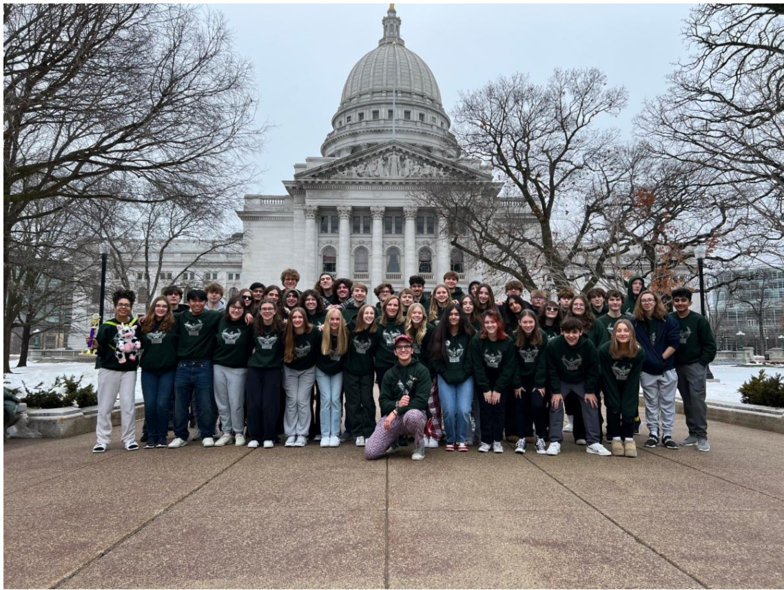
Homestead High School's Latin Program that won 1st place overall at the Latin Convention in Madison last weekend.