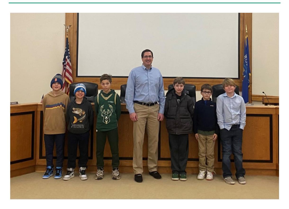
Boy Scout Troop 3865 visited City Hall last Friday and received a tour from Mayor Nerbun.

Please click here to view the Ozaukee County Board of Supervisors' January 3 meeting minutes.