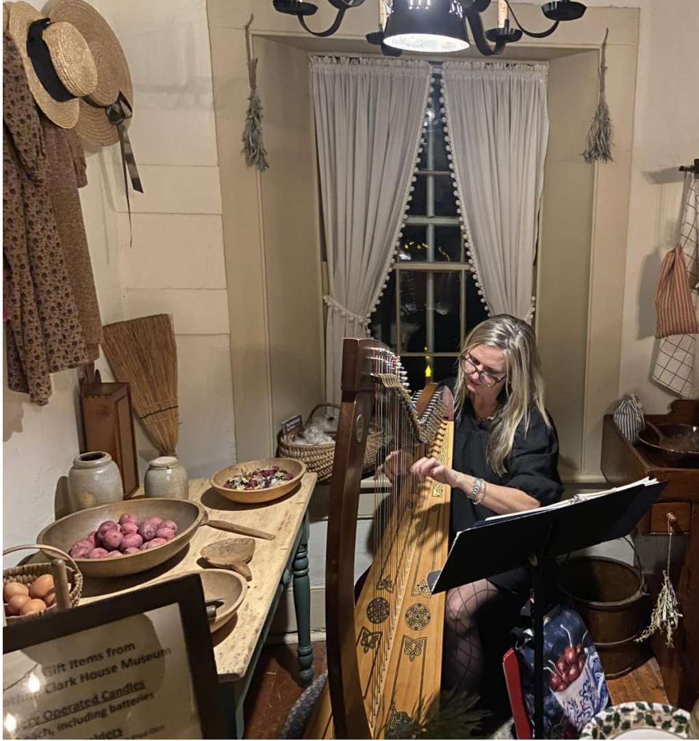
Holiday Lights at the Jonathan Clark House