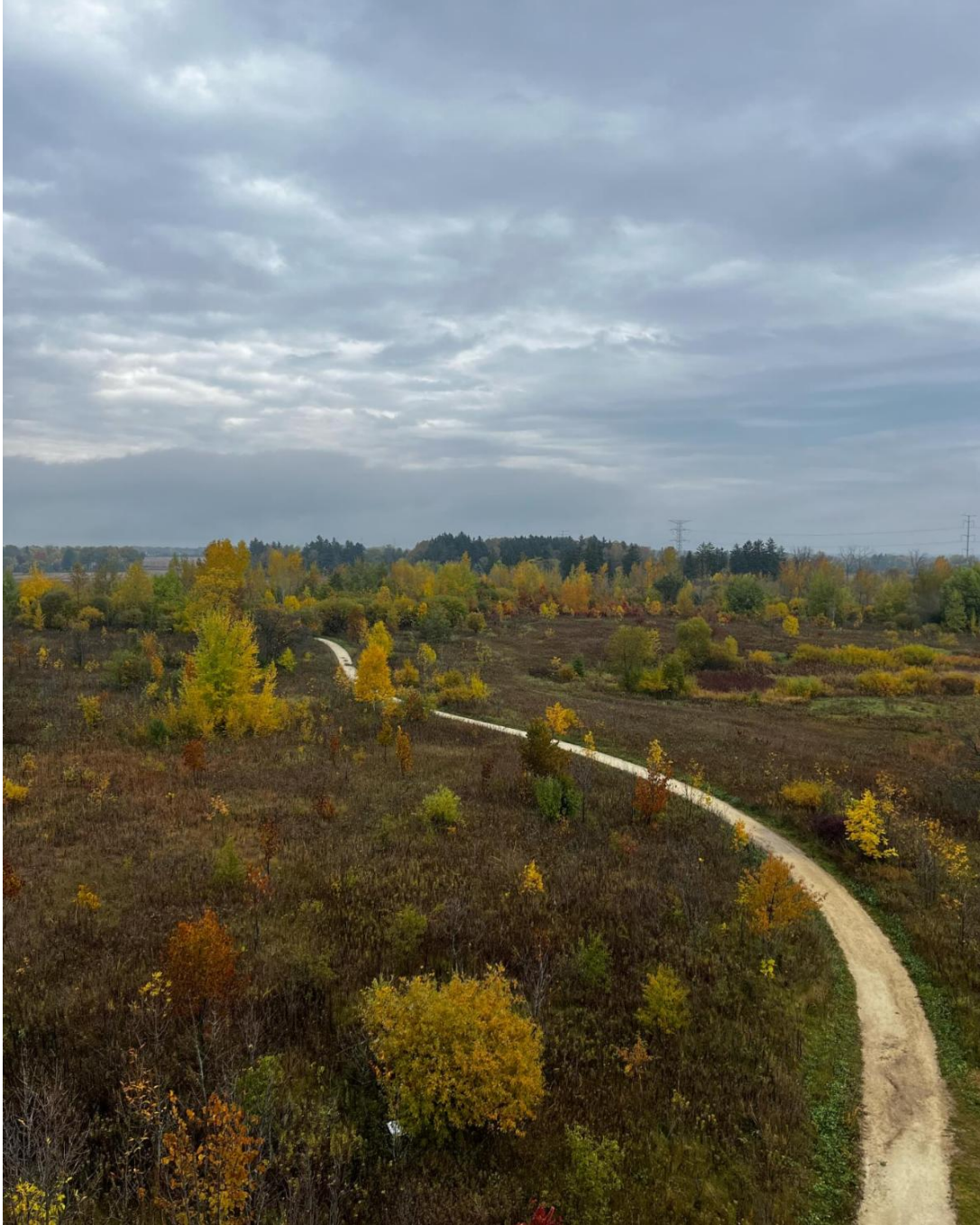
Photo Courtesy of the Mequon Nature Preserve. Go take a hike on their trails!