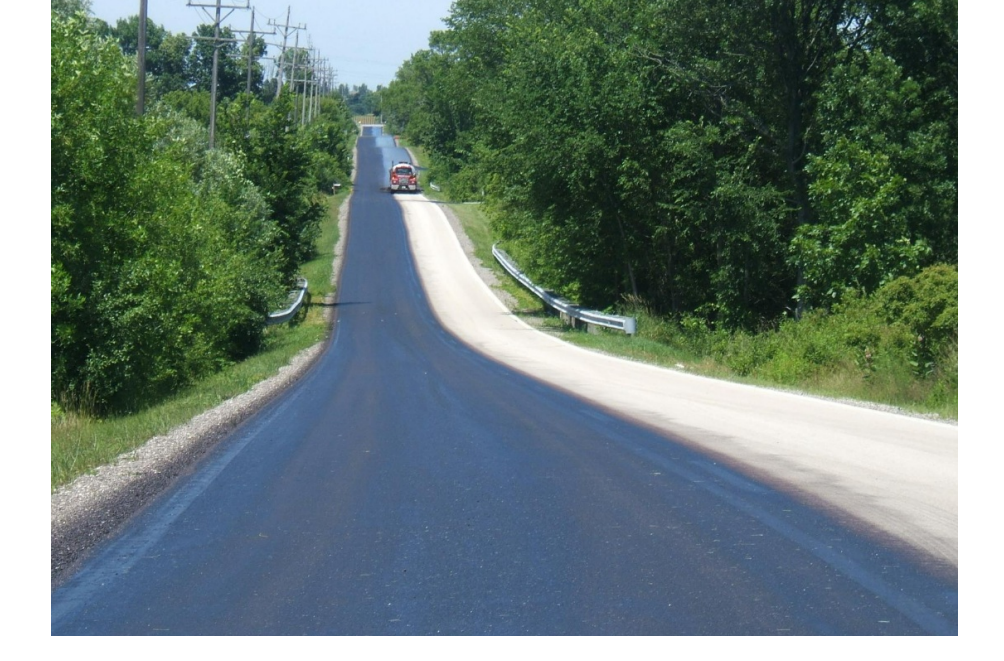
The 2023 Road Program began on May 8 with Crack Seal and GSB-88 Bituminous Seal surface treatment applications on select roads throughout the City. Both of these treatment projects are anticipated to be completed within the next couple of weeks.

Road Program construction is anticipated to begin the week of July 31. The City's contractor, Payne & Dolan, will have crews working throughout the project area to complete preparatory work in advance of the selected roads being repaved. Streets and subdivisions included in the 2023 Road Program are the following: River Road (Highland Road to Freistadt Road), Trillium Road, Trillium Court, Helen Drive, Phillip Drive, Rael Drive, Shoreland Parkway, St James Court, Hunt Club Court, Grace Court, and Ravine Farm Subdivision. It is currently estimated that all work in Mequon will take approximately four to six weeks to complete. The anticipated project completion date is September 1.