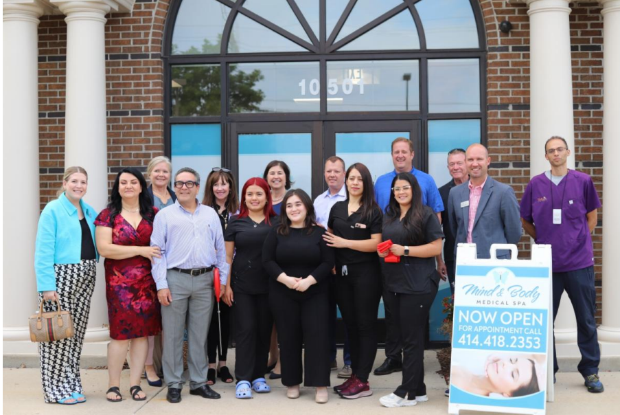
Chamber of Commerce Ribbon-Cutting at Mind & Body Medical Spa