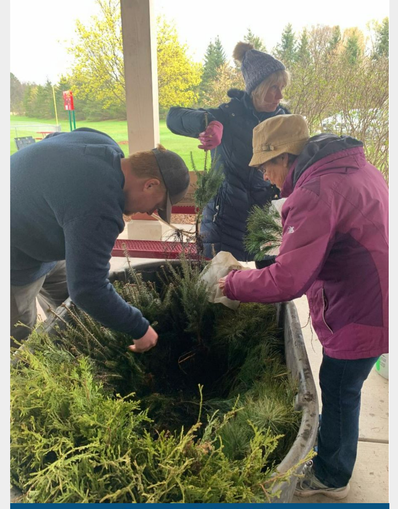
Preserving Quality Of Life