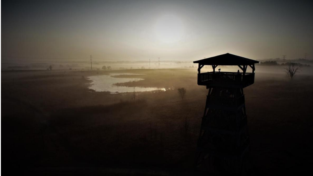
at the Mequon Nature Preserve