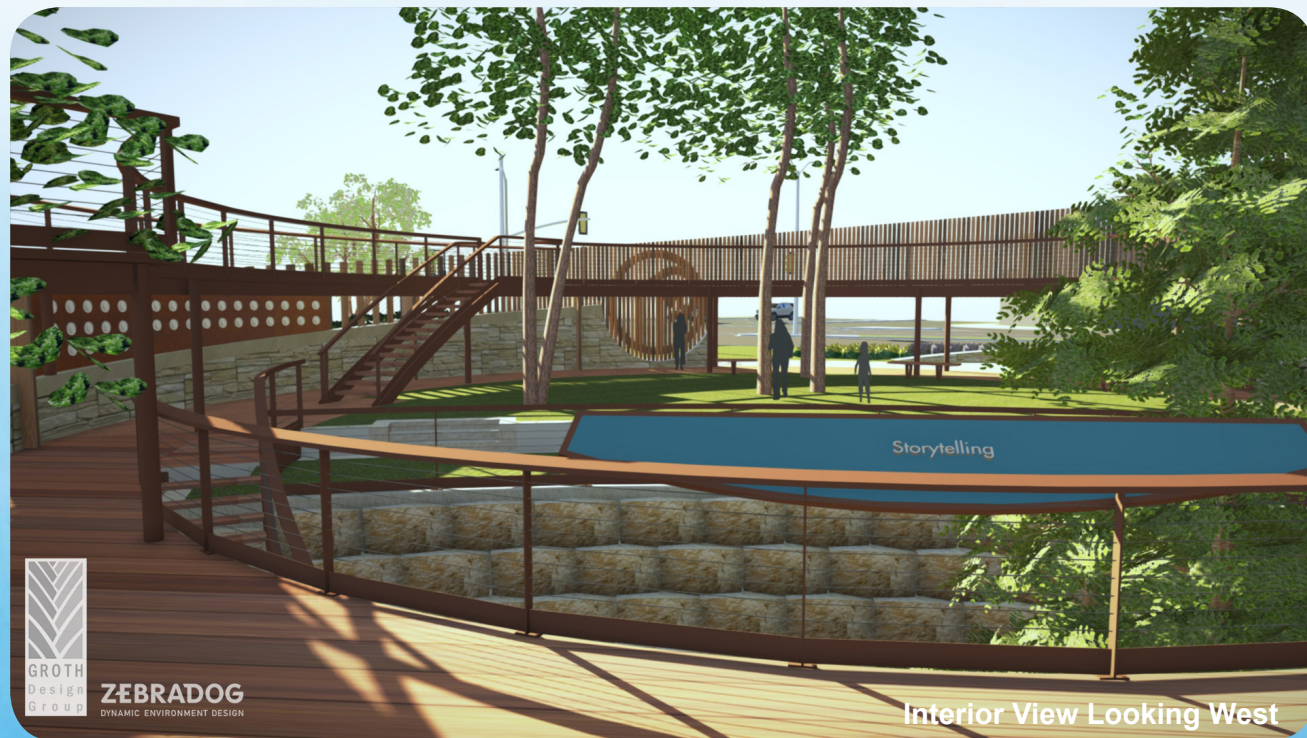
Interior View Looking West